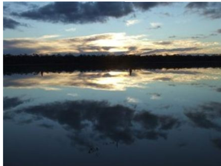
Green Lake at Sunset Muller Paddy Weekend 2009